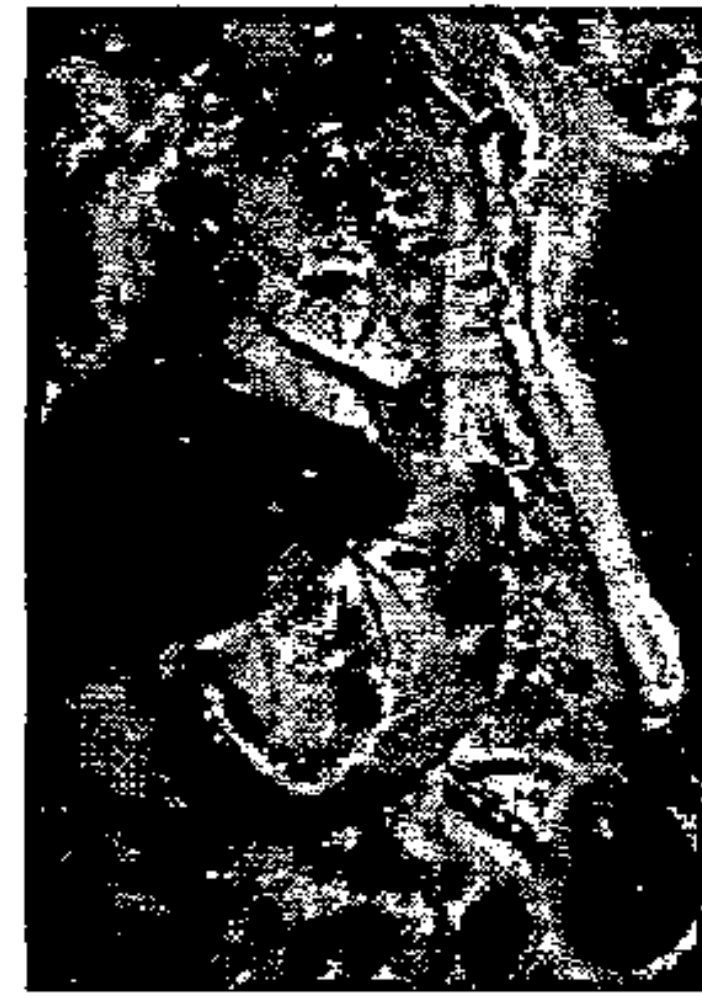
FIG 1: Macroscopic lesions observed in a dead domestic rabbit from a rabbitry. The lesions are specific to rabbit haemorrhagic disease: haemorrhages in lungs, heart and kidneys,

pale and friable liver, and congested and enlarged spleen were all seen